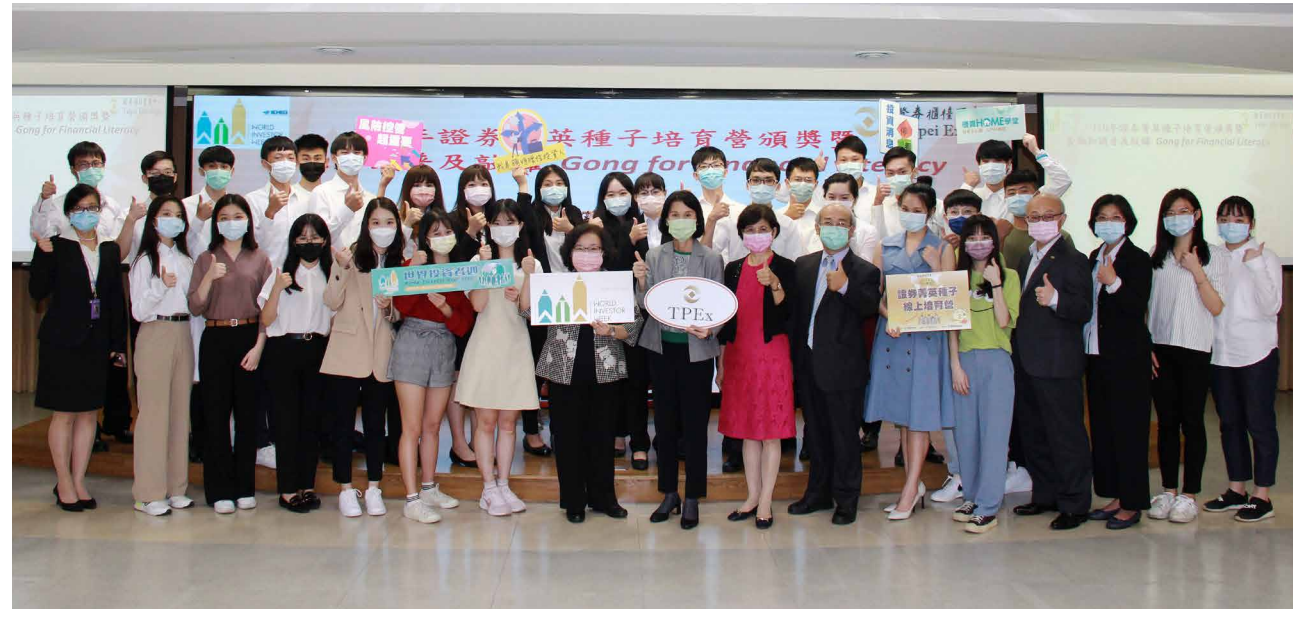
In support of World Investor Week, TPEx organized the "Ring the Bell for Financial Literacy" event in combination with the award ceremony for college camp contest

Through vigorous promotional strategies and making the most of Internet, social media and digital channels, TPEx actively publicizes TPEx market systems and products, promotes financial literacy, steps up the promotion of correct investment and wealth management knowledge among younger generation and college students, instill in them the concept of risk management, and cultivate new forces for the capital market.