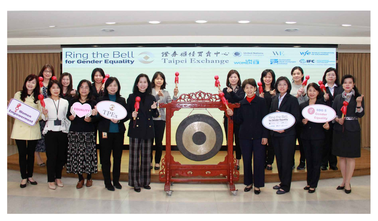
TPEx held a gong striking ceremony in response to the WFE initiative on gender equality

In addition, in support of the WFE "Ring the Bell for Gender Equality" and "Ring the Bell for Financial Literacy" co-hosted by the WEF and the IOSCO during the "World Investor Week 2021, WIW", TPEx also held a ceremony to support the two events.